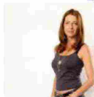
How to Dress Italian | Italy