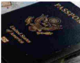
Moving to Italy: items and furniture you can bring with you | Italy