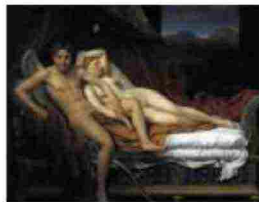
Sex and Italians | Italy