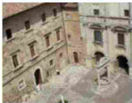
Moving from the UK to Italy - Part 3 | Italy